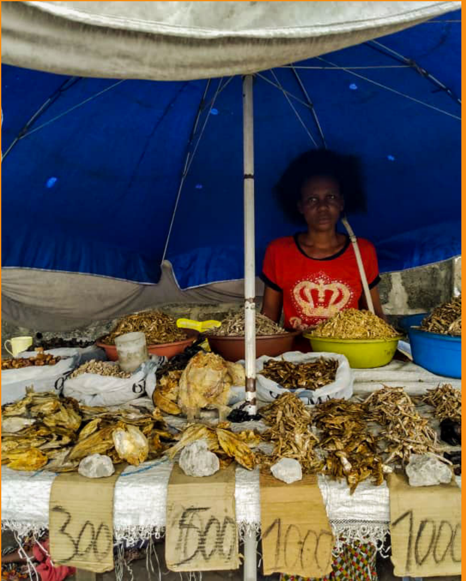
One of the entrepreneurs at her stall selling dried fish.