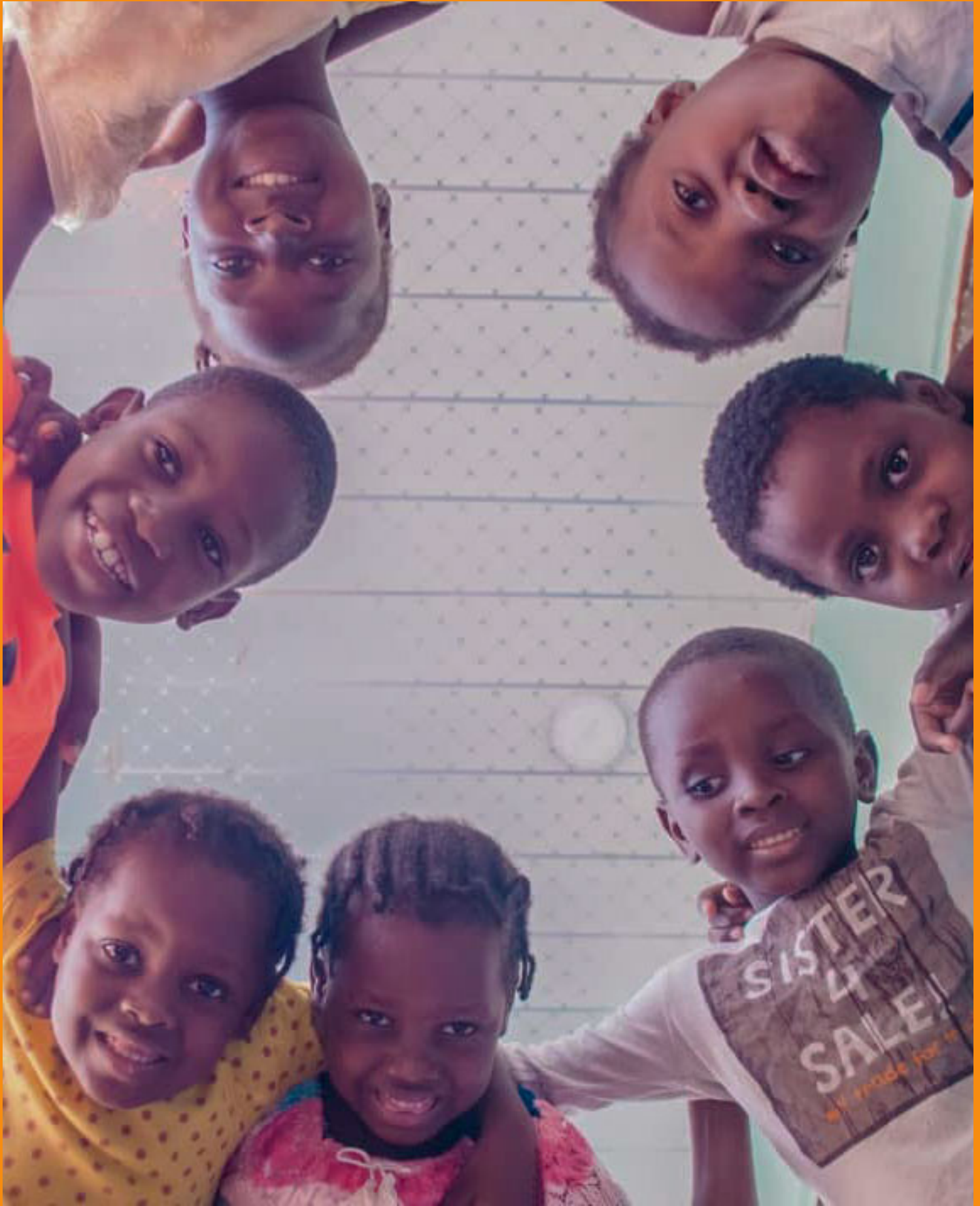
Youngsters as they waited for screening for malaria and typhoid.