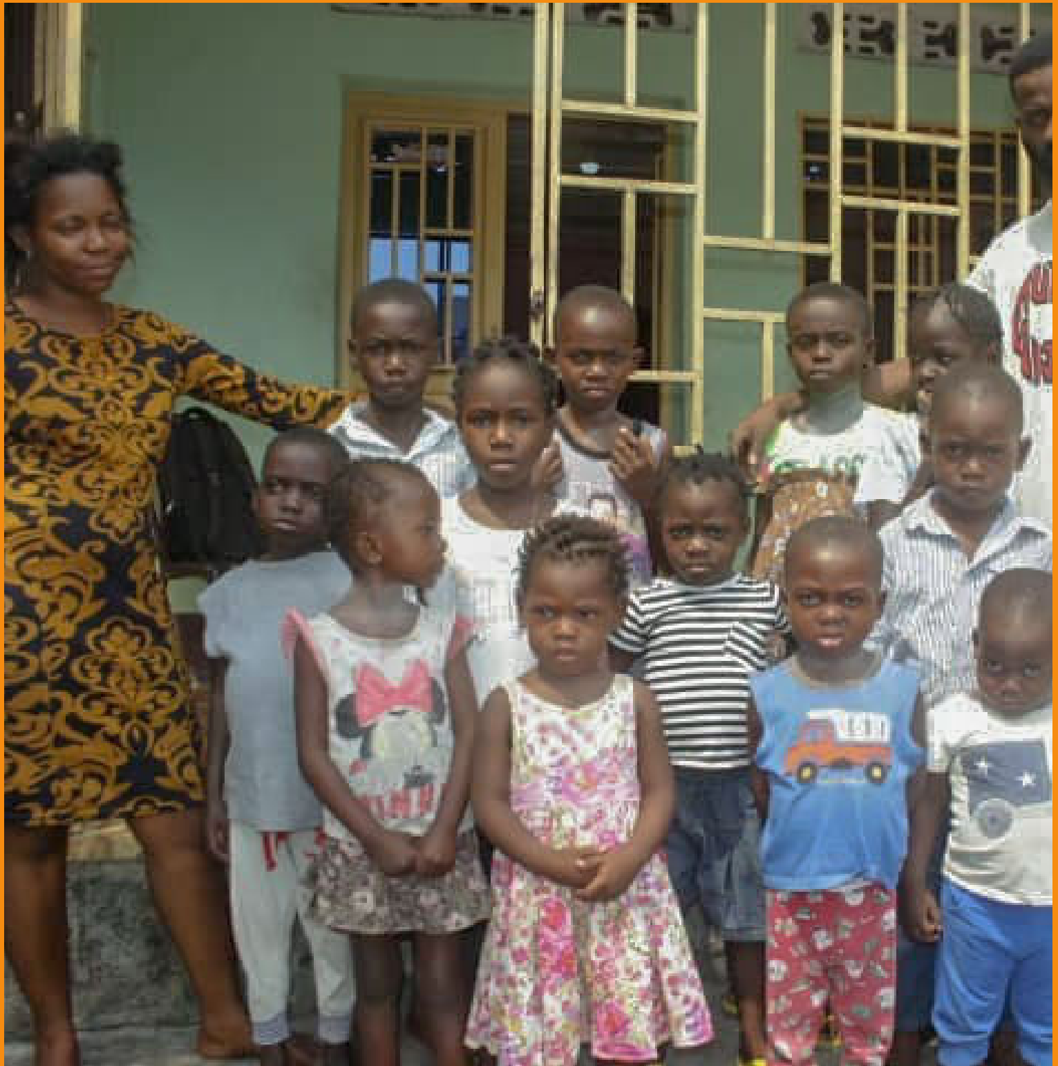
Young adventurers and their faithful companions.